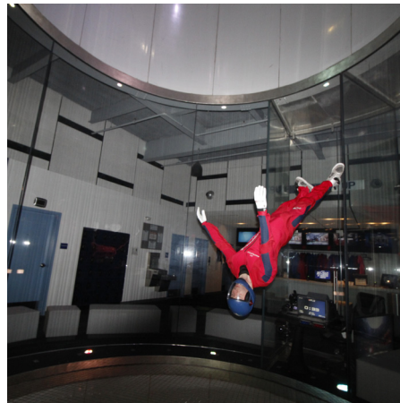
Head Down Carve