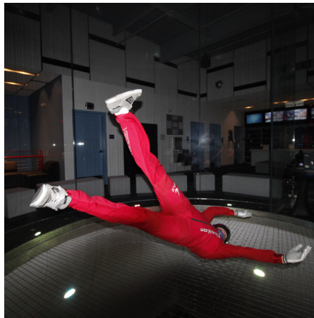
540 Degree Barrel Roll